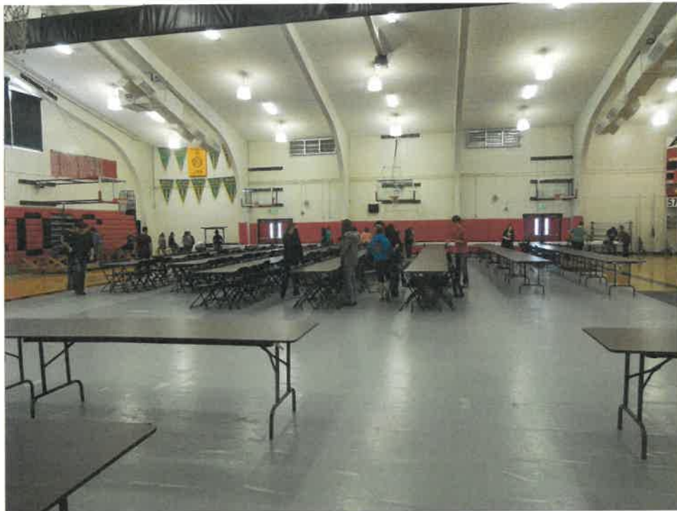
High school classes and the alumni board set up for the banquet.

Classes gather and have reunions on that weekend and many attend the banquet. It is a great time to get together and reminisce about their time at good old RHS and LRHS. Fun times are had by all. There are usually 300 to 400 people in attendance.