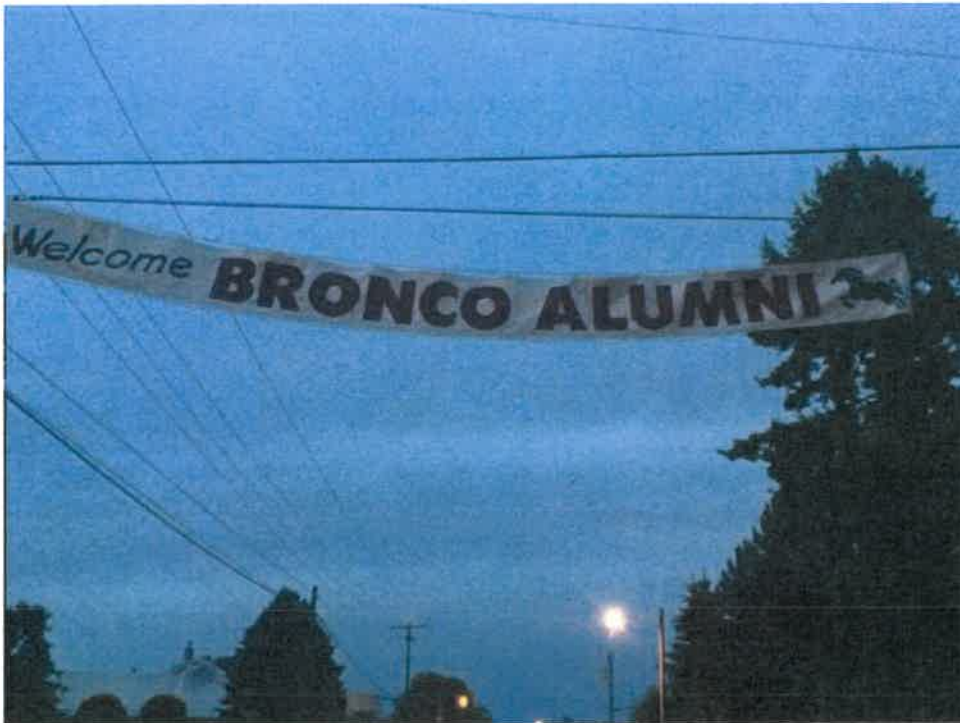
Welcome sign that hangs over Division Street during Alumni weekend!